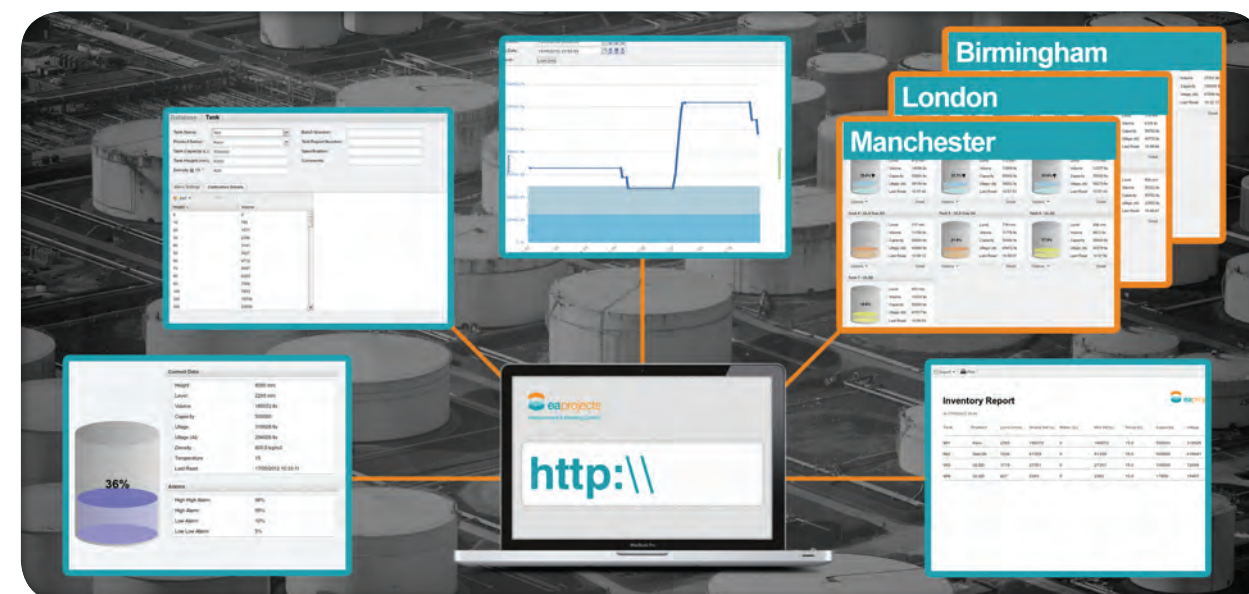
Remote tank farm access